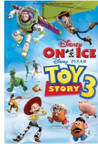
Toy Story 3

Over 600 MDCA-Head Start students got a chance to attend Disney on Ice Toy Story 3 Sunday, Jan. 16 and Monday, Jan. 17 because of a donation from Feld Entertainment. Based on the feedback, our families enjoyed the show immensely.