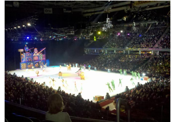
MDCA families were among thousands who enjoyed the show.