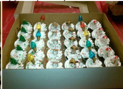
Mmmmm Mmmmm Cupcakes!