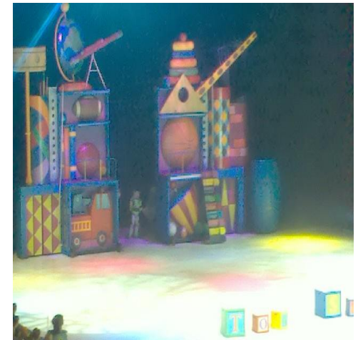
The set for Toy Story 3 was full of bright colors and animated Disney characters who kept the attention of the young and old at heart.