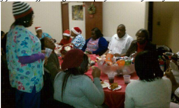
Staff members talked, laughed and ate plenty in celebration of the holidays.